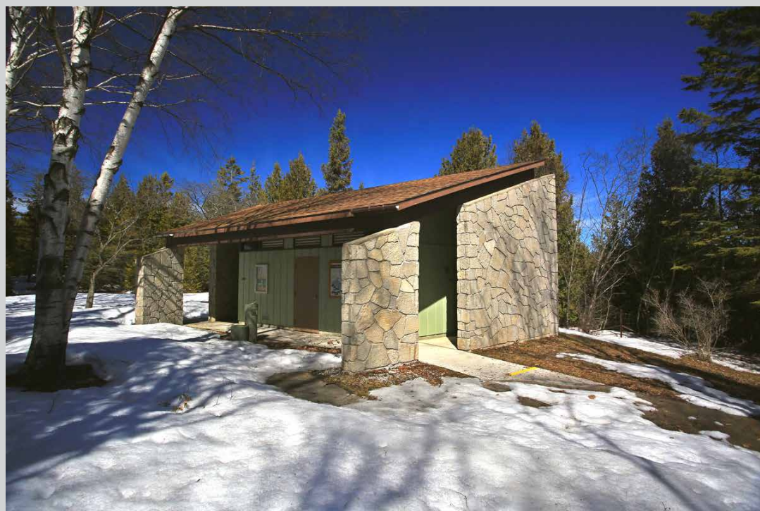
Handsome Contextual Architecture