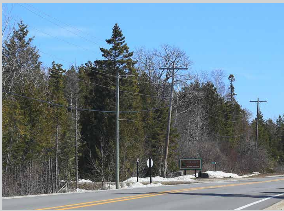
Site Entry - Boulevard Drive