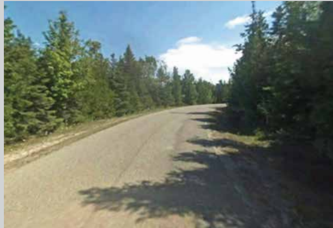
Sense of Arrival