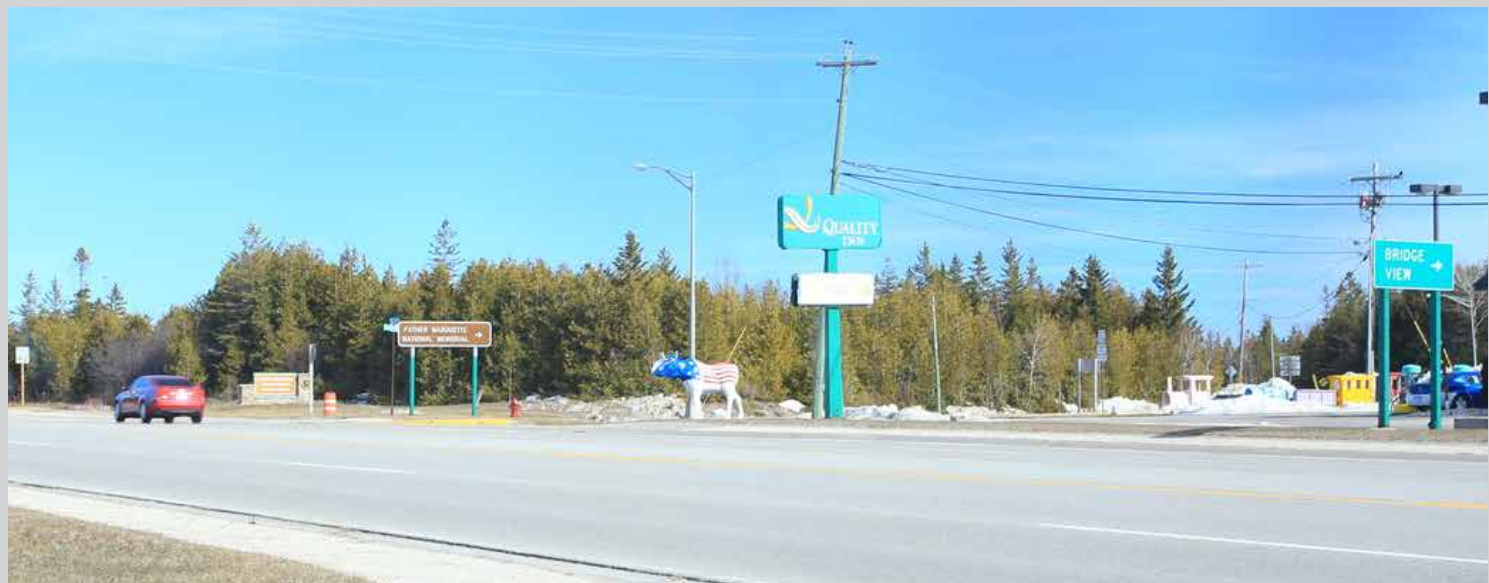
Site Entry from North - US 2